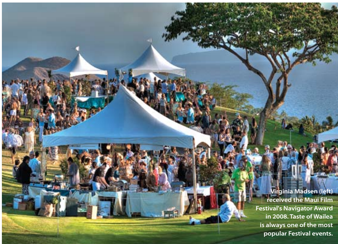
Virginia Madsen (left) received the Maui Film Festival's Navigator Award in 2008. Taste of Wailea is always one of the most popular Festival events.

“I have watched it grow from a small, local work of passion to a film festival of worldwide significance,” sums up Maui entertainment producer and restaurateur Shep Gordon.