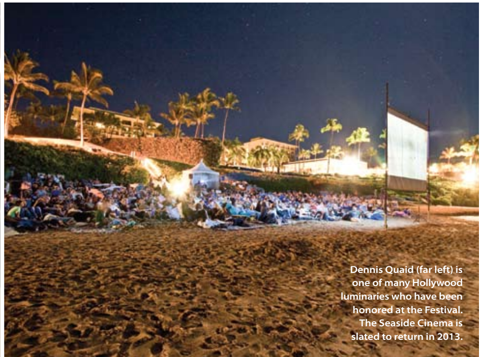
Dennis Quaid (far left) is one of many Hollywood luminaries who have been honored at the Festival. The Seaside Cinema is slated to return in 2013.