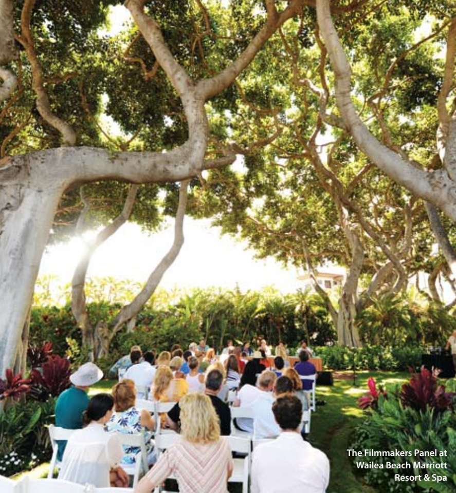
The Filmmakers Panel at Wailea Beach Marriott Resort & Spa