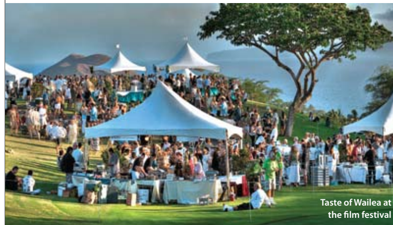
Taste of Wailea at the film festival

One year there was a chocolate fountain, another year a mini-doughnut maker. Designer chocolate is a staple, with a dash of vanilla shortbread, white chocolate mousse, or a Godiva chocolate cocktail for an extra kick. Themes vary each year, and there are always surprises. But when you’re oceanfront under Maui skies with chocolate at your fingertips, life couldn’t get any better. For information: mauifilmfestival.com .